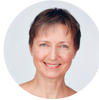
Sabine Zigelski Bundeskartellamt